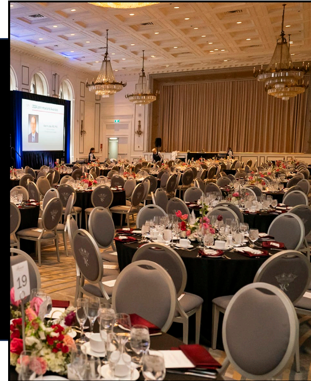
2024 Howland Gala Fairmont Royal York Hotel Toronto, Canada