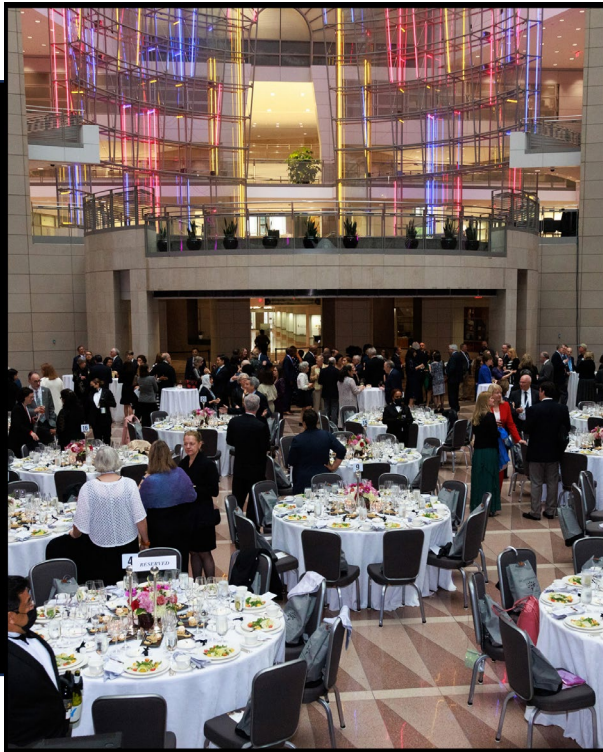
2023 Howland Gala Ronald Regan Building & International Trade Center Washington, D.C.